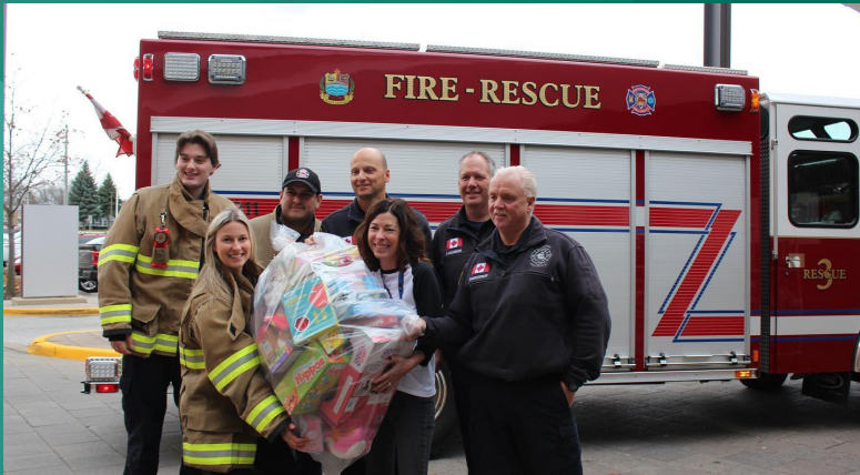
A special Christmas delivery from Point Edward Fire & Rescue, who donated over 200 gifts following the Santa's Responders Toy Drive